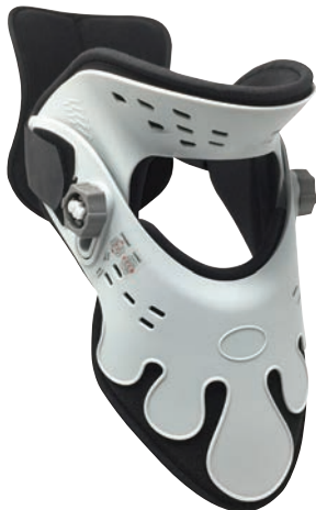
ManaEZ COLLAR 80