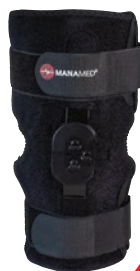
ManaEZ WRAP 33