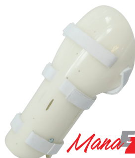
ManaEZ HUMERUS Universal