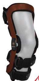
ManaForce RT RIGID