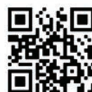
ManaEZ® ROM Elite/ ManaEZ® ROM Elite Short