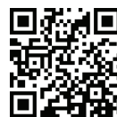
ManaEZ® Ankle Stirrup