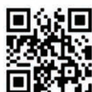
Mini Kahuna Brace