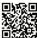
ManaEZ® Thumb Spica