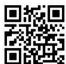
ManaEZ® ROM Ice