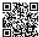
ManaEZ® Humerus Uni