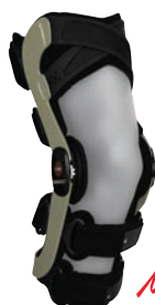
ManaForce ATC Active