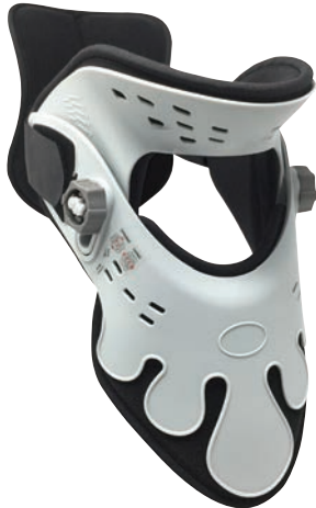
ManaEZ COLLAR 74