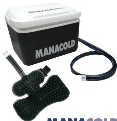
MANACOLD PLATINUM Shoulder Combo Unit