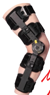
ManaEZ ROM ELITE ManaEZ ROM SHORT