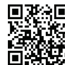
ManaEZ® Ankle 02