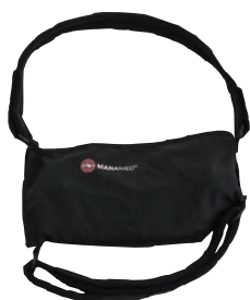
ManaEZ SLING Universal