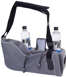
KANGAROO Shoulder Sling