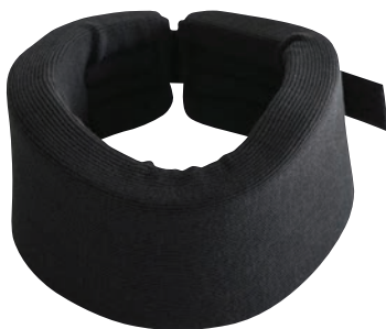
ManaEZ SOFT COLLAR Universal