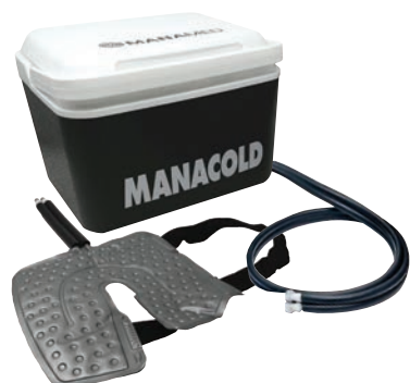
MANACOLD PLATINUM Universal Combo Unit