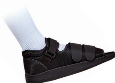
ManaEZ Post-Op SQ Toe Shoe