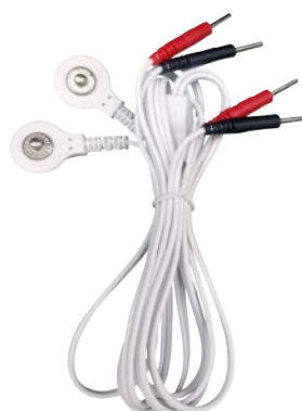
ManaFlexx 2 Lead Wires