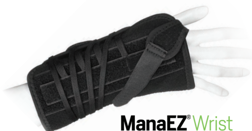
ManaEZ ® Wrist