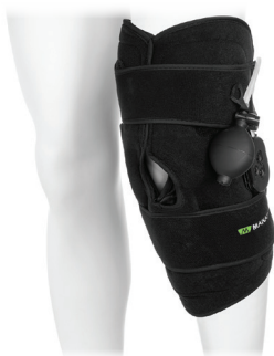
ManaEZ ® ROM Ice