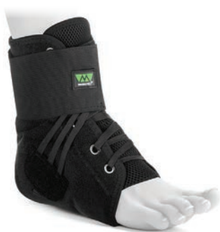
ManaEZ Ankle 02