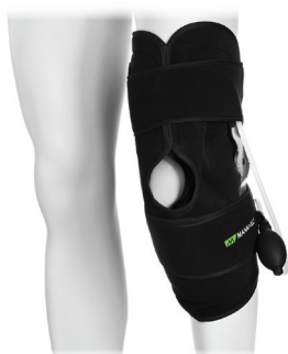
ManaEZ ® Hinged Ice