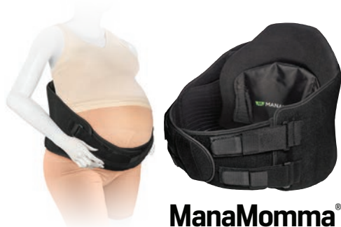
ManaMomma® Maternity Back Brace