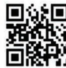
ManaEZ® ROM Elite/ ManaEZ® ROM Elite Short