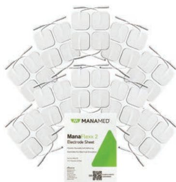
ManaFlexx 2 Electrode Sheet 10 pack