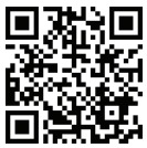
ManaEZ® Humerus Uni