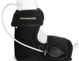
ManaEZ ® Ankle Ice