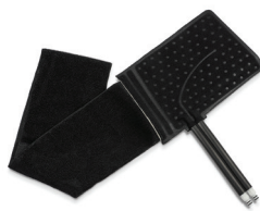
ManaCold Platinum Back Pad