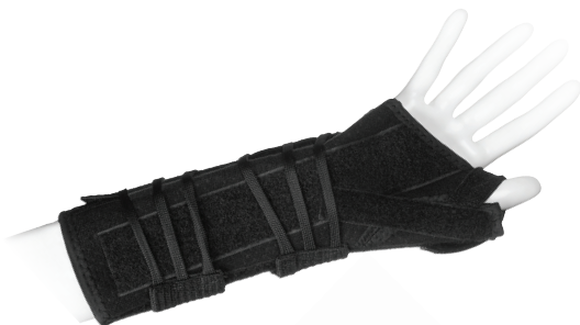
ManaEZ ® Thumb Spica