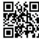
Mini Kahuna Brace