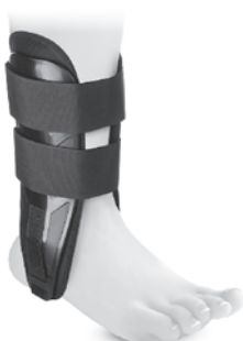
ManaEZ Ankle Stirrup