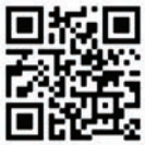
ManaEZ® ROM Ice