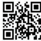
ManaEZ® Hip Ice