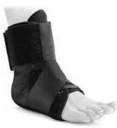
ManaEZ® Ankle 06