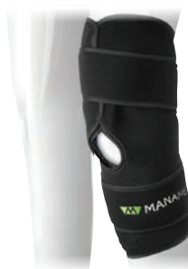
ManaEZ® Ice Wrap Knee