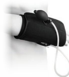
ManaEZ® Ice Wrist