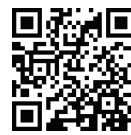
ManaEZ® Ankle Stirrup