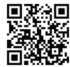
ManaEZ® Ankle 02