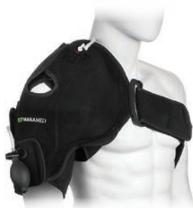
ManaEZ® Shoulder Ice