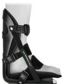
ManaEZ Night Splint Plantar Fasciitis