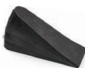
MAC Achilles Wedge Insole