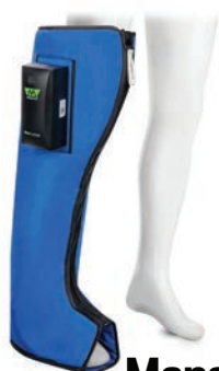
ManaFlow® 51 Full