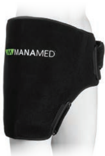
ManaEZ® Ice Wrap Hip