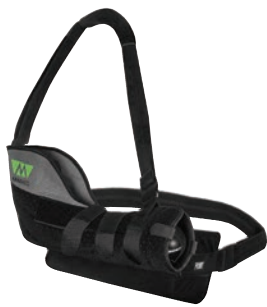
Mini Kahuna® Brace