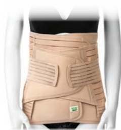
Three-In-One Belly Band