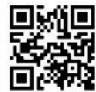
ManaEZ® Spring & Standard Crutch