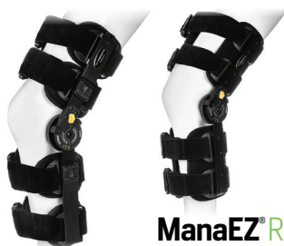
ManaEZ® ROM Elite Short