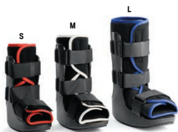
ManaEZ® Boot Pediatric