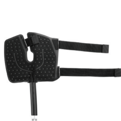
ManaCold Platinum Universal Circulating Pad

• Universal Pad Suggested HCPCS: E1399 or E0249