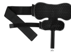
ManaCold Platinum Shoulder Pad