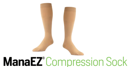
ManaEZ® Compression Sock