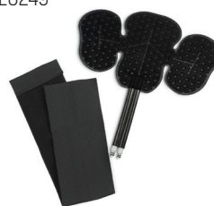
ManaCold Platinum Hip Pad