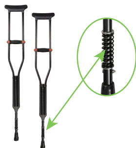
ManaEZ® Crutch Spring