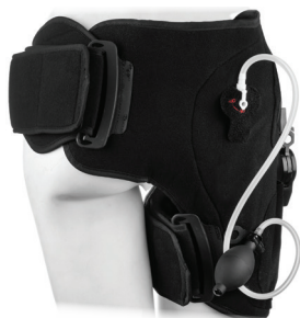
ManaEZ ® Hip Ice